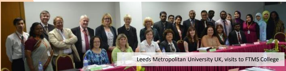
Leeds Metropolitan University UK, visits to FTMS College